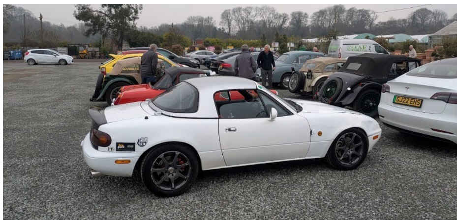
Ready for the MGCC SE scatter rally on 23 March

We're at the point of the year where the winter events like navigational rallies are petering out, and the longer days and warmer temperatures allow other types of motorsport like circuit events and grass autotests to come out of hibernation. Finishing off the 12 Car rally season we had two events in March, run by our friends at Bexley and Blackpalfrey. More friends at Maidstone and Mid-Kent ran the second round of the Autosolo season at Ashford on 15 March, while the first round of the Insite Graphics Sevenoaks Speed League took place at Cadwell Park on 29 March. Details on all of these later in this issue.