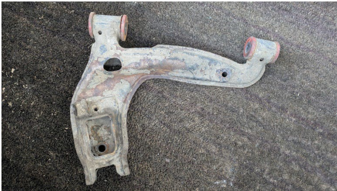
It is supposed to be flat...

After being towed back onto the road after the final 12 Car I had to leave the car overnight and come back the next day to collect it. After unloading and jacking it up, it seemed like it really was just the wishbone that took the brunt, plus the wing and bumper on that side. I took the wishbone off, swapped the bushes into a spare one I had in the garage and fitted that, and then was able to drive it up into the garage to get a proper look. There were a few other bits that needed 'persuasion' back to where they should be, but overall not too bad (and no injuries for Andy or me, or anything else).