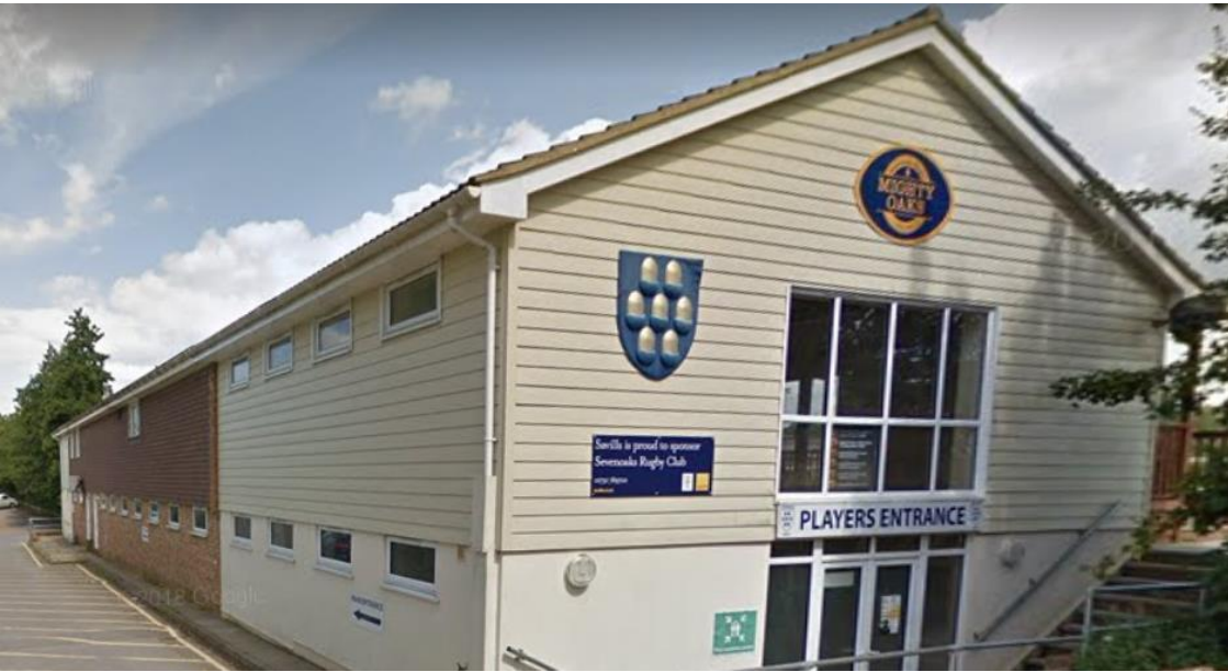
The Sevenoaks Rugby Clubhouse, where the SDMC first met in 1954.